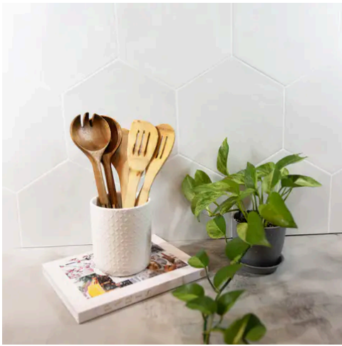
Studio 11.5x10 Light Matte Hexagon Tile